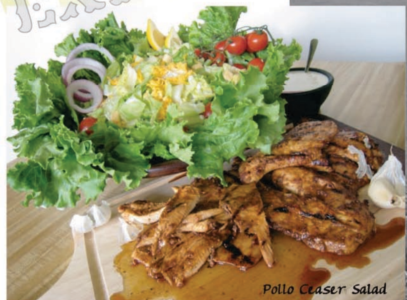
Pollo Caesar Salad